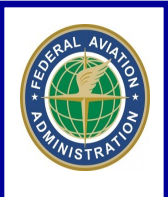
8/19 Aviation Day