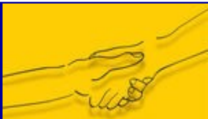
8/5 Happy Friendship Day

Our Snow birds will be hurrying back not wanting to miss out on all the fun & enjoyment. The summer months have not taken a vacation from the decision making concerning the maintenance and development of our beautiful neighborhood. I hope to see more of you at the Board meetings in the fall.