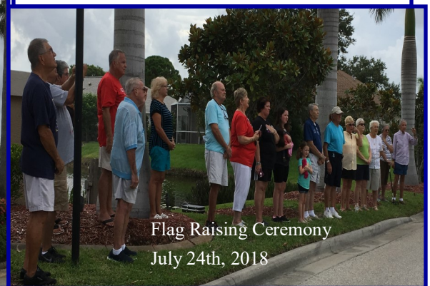
Flag Raising Ceremony July 24th, 2018