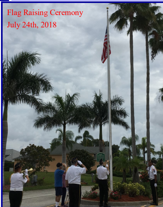
Flag Raising Ceremony July 24th, 2018