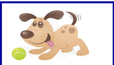
8/26 Happy Dog Day