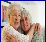
8/3 Beer Day 8/5 Sister Day