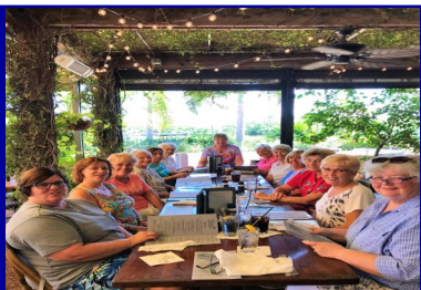
8/1 Girlfriend Day